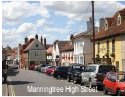
Foundry Court Manningtree