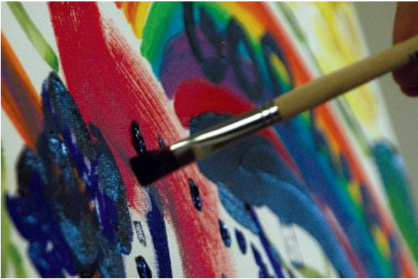
Art and crafts