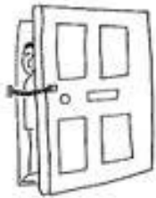
Being safe in your home