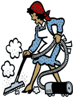
Keeping your house clean