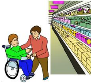
Getting your shopping